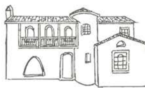
Spanish Colonial Revival