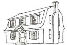
Dutch Colonial Revival